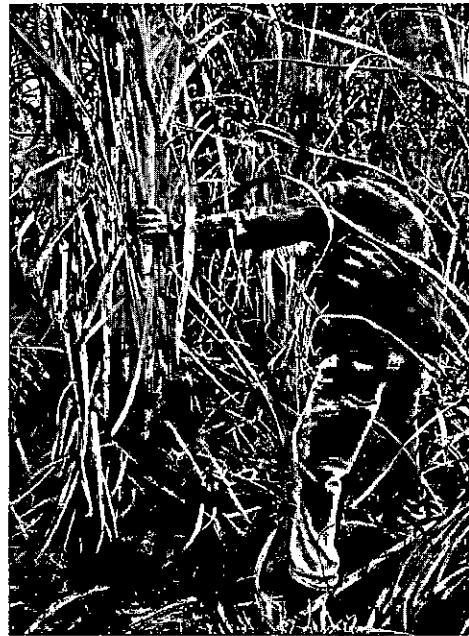
Cane Cutting at field day 07

Each participant will be allowed to cut 15 stalks of each variety for seed/propagation materials only.